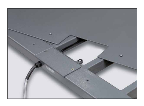
■ Weighing plate can be unscrewed - The weighing plate can be conveniently unscrewed for maintenance or cleaning purposes