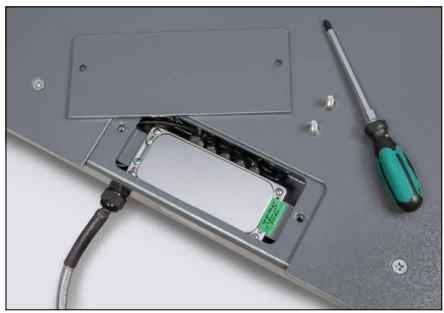
Easy levelling of the weighing bridge as well as access to the junction box from above