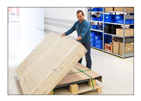
Did you know? Our floor scales are delivered in a robust wooden box. This protects the high-quality weighing technology from environmental influences and stresses during transportation. KERN – always one step ahead