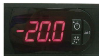
▲ LED display