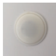
▲ Test hole