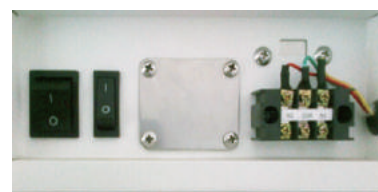
▲ Remote alarm contact