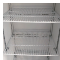
▲ Adjustable shelf