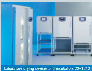
Laboratory drying devices and incubators 22-1212 I