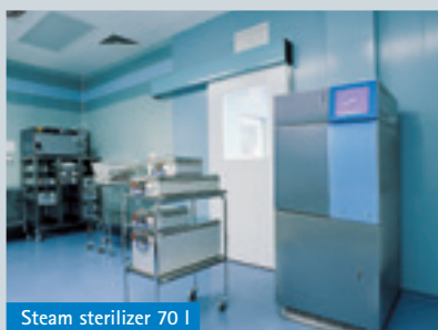
Steam sterilizer 70 I