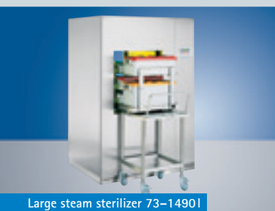
Large steam sterilizer 73-1490 I