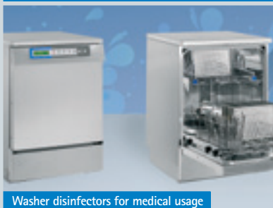
Washer disinfectors for medical usage