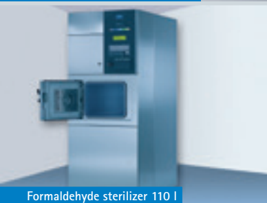
Formaldehyde sterilizer 110 I