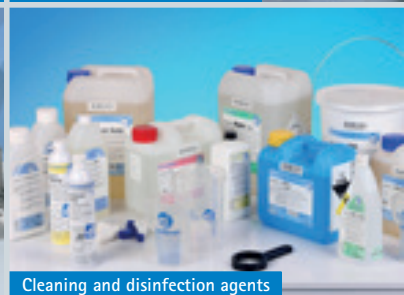
Cleaning and disinfection agents