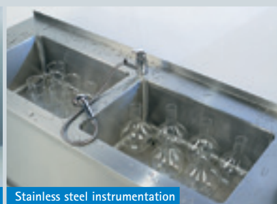
Stainless steel instrumentation